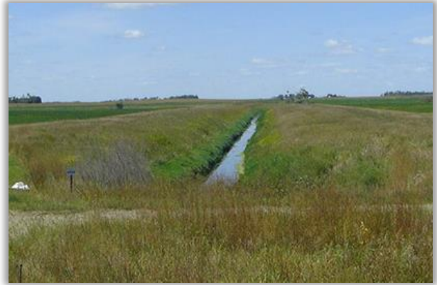
A grass buffer strip in Redwood County.

Yes. The 2015 Buffer Law relies on long-standing federal, state, and local programs to provide financial and technical support to landowners to implement buffers or alternative water quality practices. Landowners may use federal Farm Bill resources, such as the Conservation Reserve Program (CRP), Continuous CRP, and the Environmental Quality Incentives Program to get buffers installed. State resources include programs such as the Reinvest in Minnesota (RIM) easement program, Conservation Cost-Share, and the Minnesota Agricultural Water Quality Certification Program (AWQCP). The BWSR Board recently approved a policy that all farms who are certified under the AWQCP are deemed compliant with the buffer law requirements.