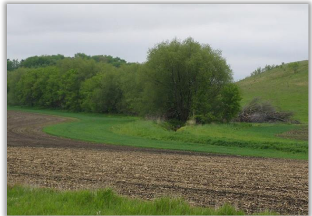
A buffer in Olmsted County.