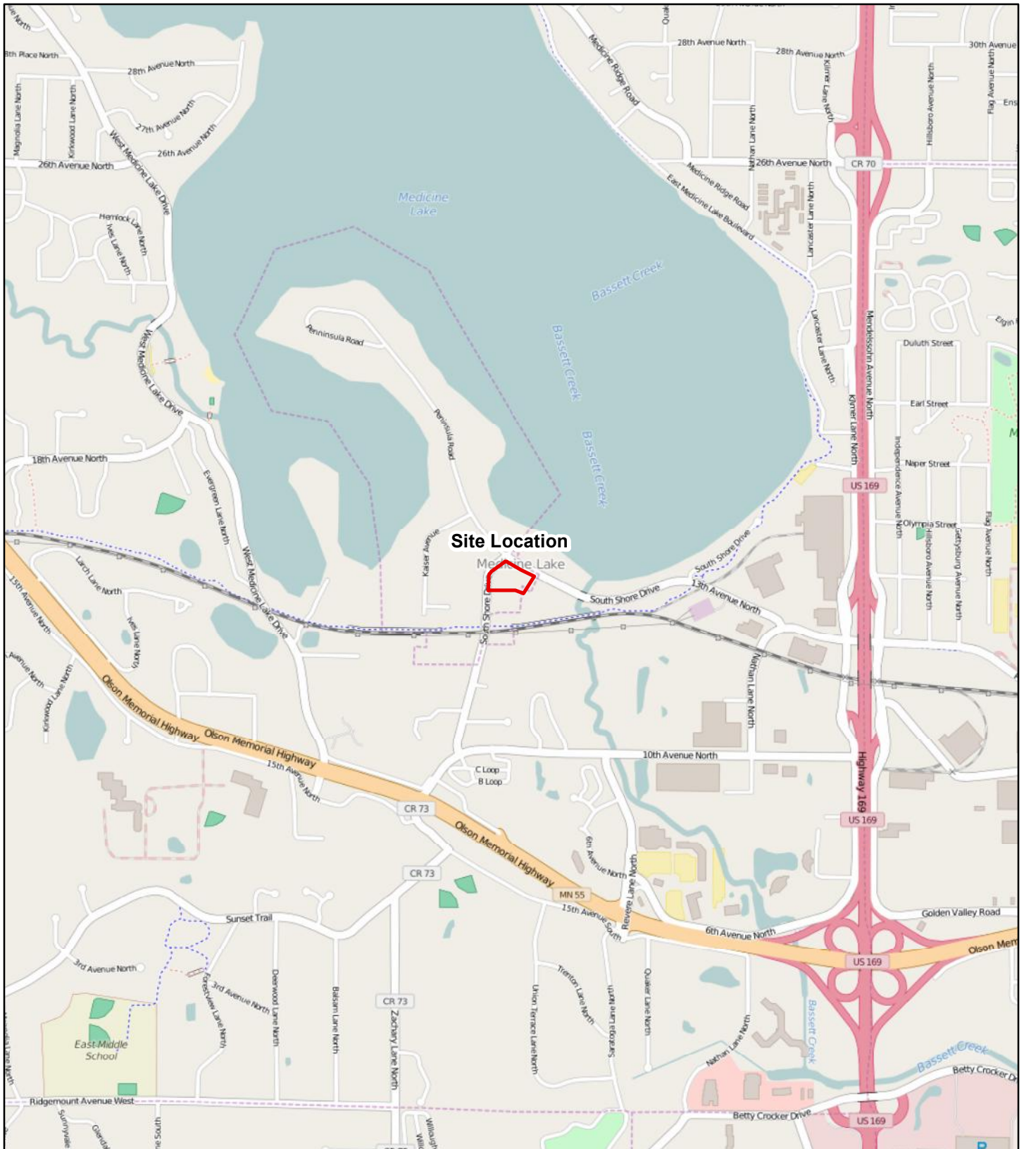
Figure 1 - Site Location